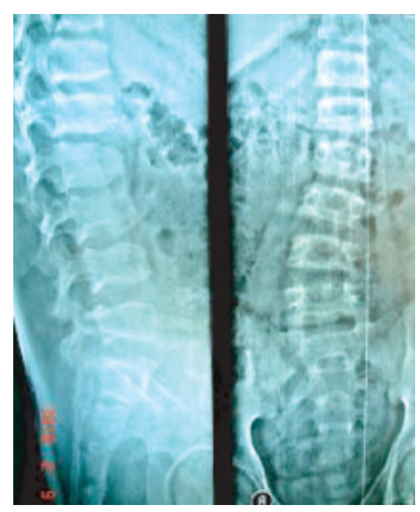
Figure-2 : X-ray Lumbosacral spine revealed Dysostosis multiplex involving thoracolumbar vertebrae with kyphoscoliosis.

particles accumulated within the swollen hepatocytes, liver architecture was distorted suggestive of chronic hepatitis progressing to cirrhosis (fig 2 & 3).